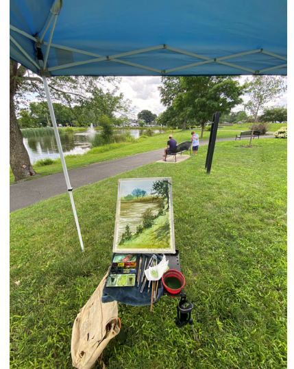
Ritvik Sharma demonstrating the Plein Air technique with watercolors.

We at CCfA have our own activities which we hope help to foster the art com-