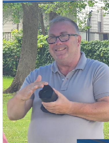
Art in the Park